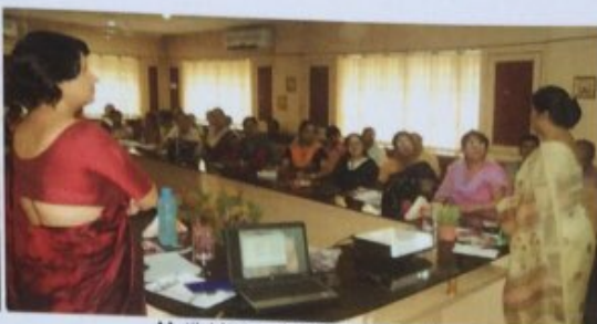
Motilal Nehru School, Jamshedpur