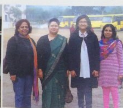
RYLA Leadership for Youth by Rotary, Dhanbad