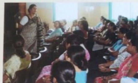
Graduating Students of Psychology & Education Department, Loreto College, Kolkata