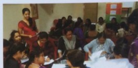
B.D. Memorial School, Kolkata