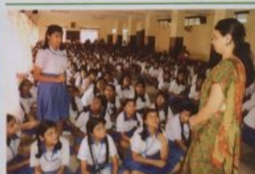
St. Agnes, Kharagpur