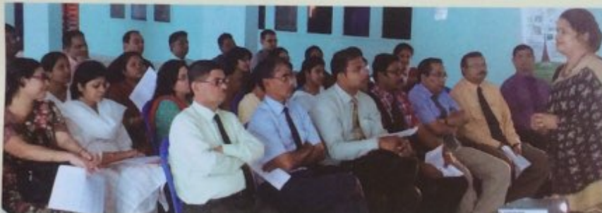
The Frank Anthony Public School, Kolkata