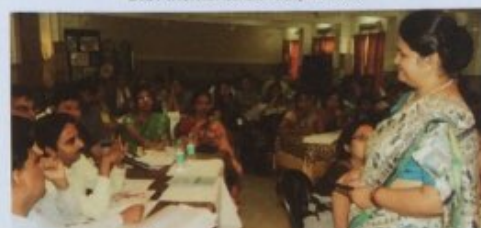
Sunbeam Group of Institutions, Varanasi