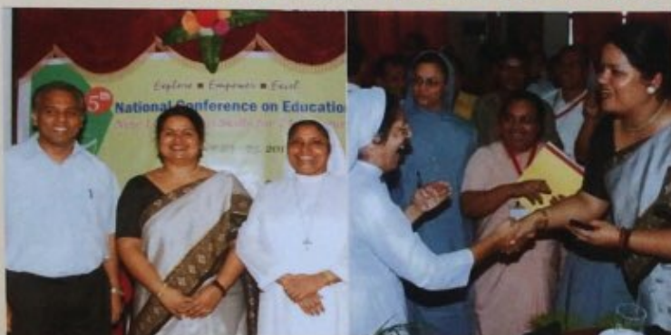
Educators as Counsellors Discipline by Design in Schools