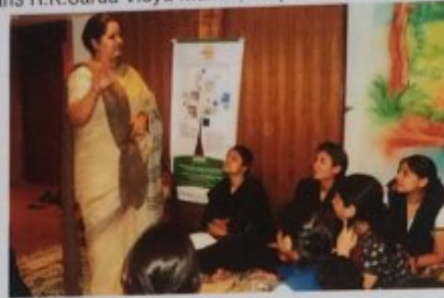
Little Scholar, Kolkata