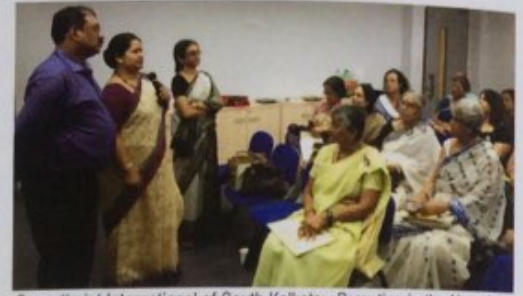
Soroptimist International of South Kolkata - Parenting in the New Age