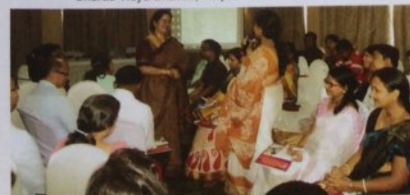
Dafodil School, Silchar