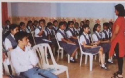
Carmel Junior College, Jamshedpur