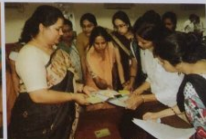
Techno India, Kolkata