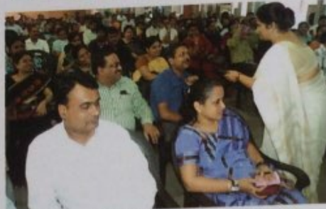
Bhawans'R.K.Sarda Vidya Mandir, Raipur