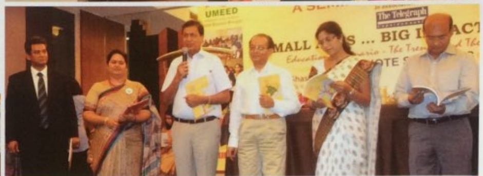
Release of Umeed Year Book