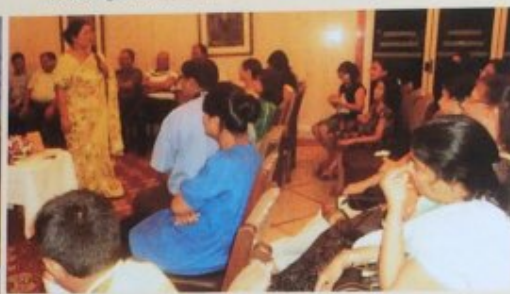
Talk on Parenting at Bengal Rowing Club

Anxieties and jitters of competitive examinations were the topics addressed at a talk conducted at Birla Industrial and Technological Museum by UMEED - A Positive Living Initiative. Queries related to the psychological and emotional aspects associated to preparation of examinations were dealt with and strategies to combat such state level examinations were suggested to the participants.