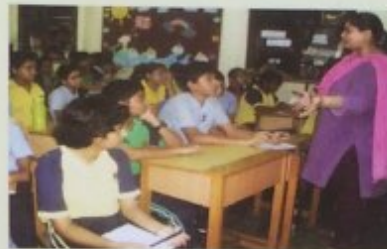
The Heritage School, Kolkata