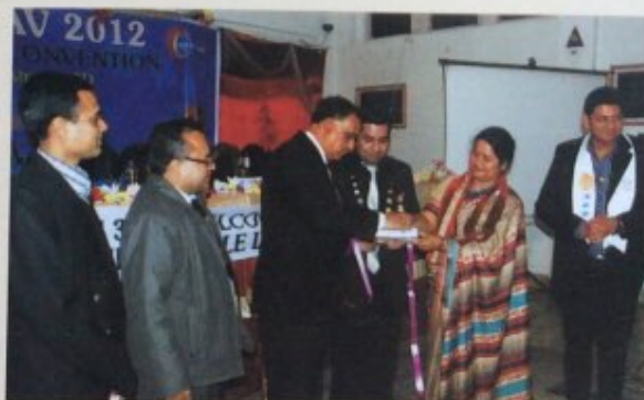
'LEOTSAV' Leo Leadership Training, Guwahati