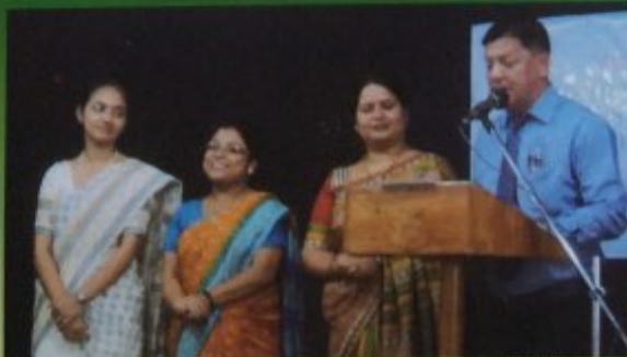
Teachers of 20 Schools of Kalimpong, Kurseong and Darjeeling participated to learn counselling skills to handle students' behaviour