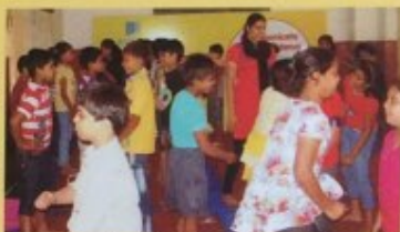
Communication with Confidence, Club Solitaire

UMEED in collaboration with Club Solitaire organized a two day workshop in Nehru Children's Museum called Communication with Confidence. It was an extremely interactive workshop which was attended by about a hundred children from various schools of Kolkata.