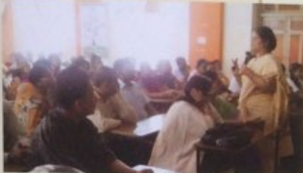
St. Mary's Orphanage and Day School, Dumdum