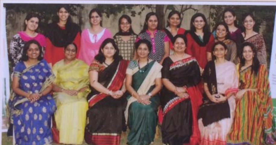
Team UMEED Wishes You a year of Infinite Success & Unlimited reasons to smile !