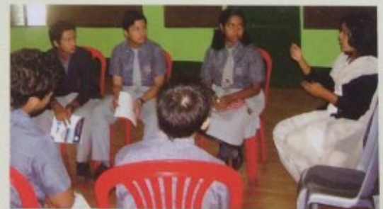
Douglas Memorial Higher Secondary School, Barrackpore