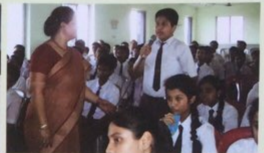
National Gems Higher Secondary School, Kolkata