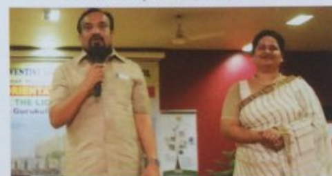
Seventh Day Adventist School, Ahmedabad