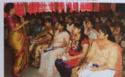
St Joseph's School, Siliguri