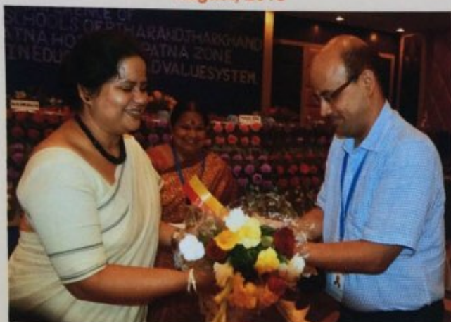
Value based Education using Technology in Schools