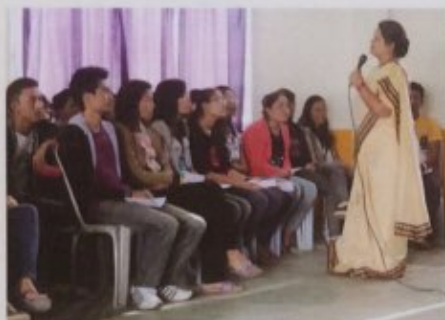
B.B Pradhan College, Kalimpong