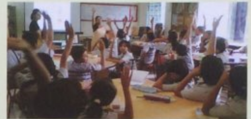
Lions Calcutta Greater Vidya Mandir, Kolkata