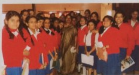
Carmel School, Durgapur