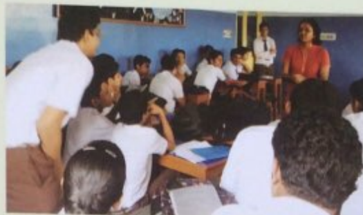
St Sebastian's School, Kolkata

St Sebastian's School National Gems H S School St. Mary's Orphanage and Day School The Heritage School Douglas Memorial H S School The Frank Anthony Public School Lions Calcutta Greater Vidya Mandir BRCM Public School Rockvale Academy Gyanoday Niketan Kerela Samajam Model School