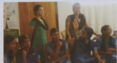
Calcutta Emmanuel School, Kolkata