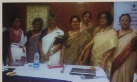
University of Womens Association