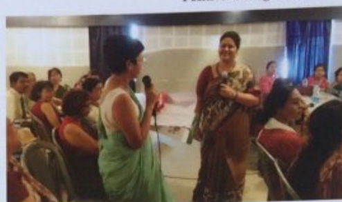
South Point School, Kolkata