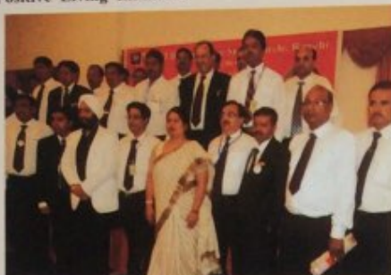
Assets for Life - Study Circle LIC, Ranchi