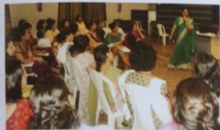
Sarla Birla School, Guwahati