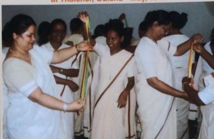
Principals as Change Agents Building Caring Classrooms