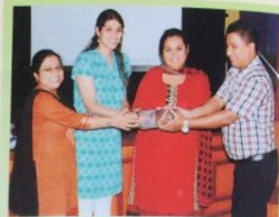
Education Fair at Ice Skating Rink