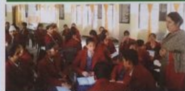
Hill Top School, Jamshedpur

"The overall concept of UMEED, their features have a good aspect of building my personality, character and improve my communication skills to a large extent." - Subhranil Banerjee , National Power Training Institute, Durgapur