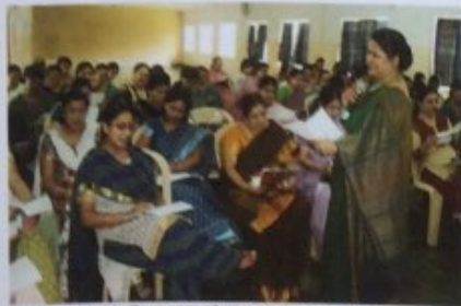
J. H. Tarapore School, Jamshedpur