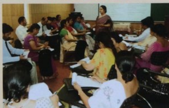
Mentoring & Coaching Skills for Heads of Schools