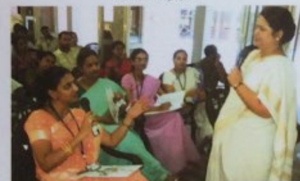
Bharati Vidya Bhavan, Raipur