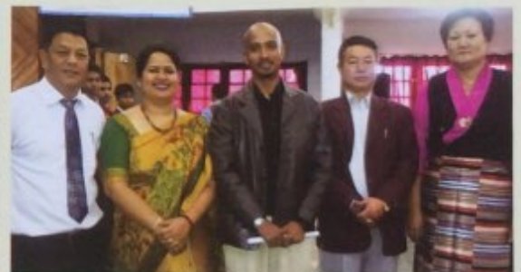
Rockvale Academy, Kalimpong

The mission of Umeed - A Positive Living Initiative has perpetually been to Empower people to evolve and discover the best in them, Enable individuals to achieve their intended goals and energize by reaching out and connecting. Umeed has been proactively making an effort through counselling interventions (teachers' training workshops, parental counselling and workshops on lifeskills) across various schools. Supported by faculty and non-faculty members of the schools, Umeed in partnership with various esteemed schools has been successful at bringing smiles and making differences in several lives.