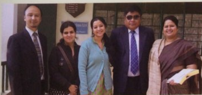
Gyanoday Niketan, Darjeeling