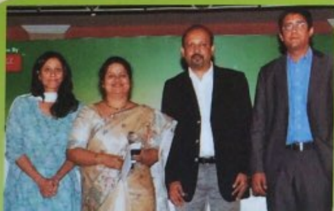
Building Empowered Relationships, Mutual Fund Round Table, 2012, Bhubaneswar by ASK

At Weaver's Studio, UMEED conducted a workshop that focused on developing a positive and healthy attitude towards life and its challenges. The workshop was attended by young women who are a part of an organization called Udayan Care.