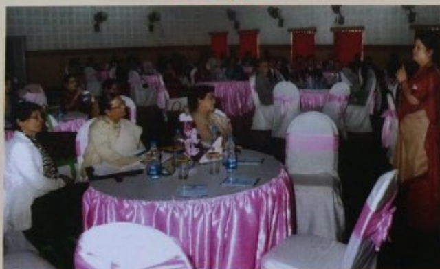
Handling Adolescent issues in Schools "Balancing Act"