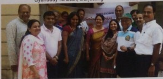
Space Town, Kolkata