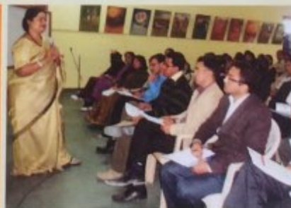
BRCM Public School Gyankunj, Bahal, Haryana

The mission of Umeed - A Positive Living Initiative has perpetually been to Empower people to evolve and discover the best in them, Enable individuals to achieve their intended goals and energize by reaching out and connecting. Umeed has been proactively making an effort through counselling interventions (teachers' training workshops, parental counselling and workshops on lifeskills) across various schools. Supported by faculty and non-faculty members of the schools, Umeed in partnership with various esteemed schools has been successful at bringing smiles and making differences in several lives.