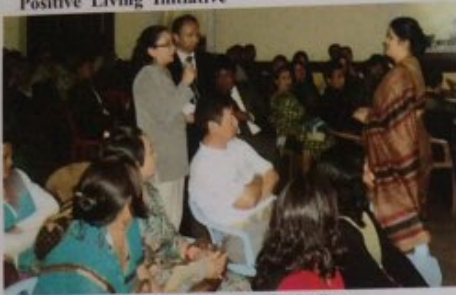
Gyanoday Niketan, Darjeeling