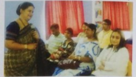
Gems Akademia International School, Kolkata