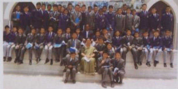
North Point School, Darjeeling