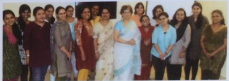
Drama Therapy by Dolly Basu