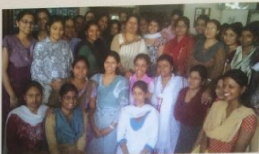
Budding Teachers at Loreto TTC Training, Kolkata