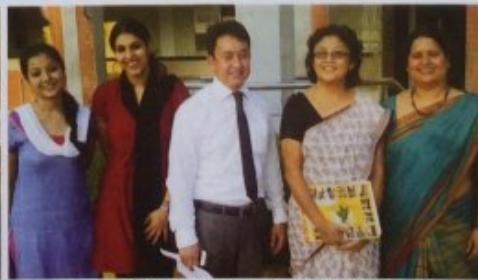
Mahbert High School, Siliguri