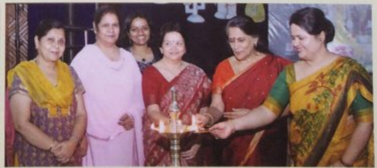
Kerela Samajam Model School, Jamshedpur