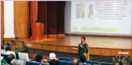
Training teachers on Gender sensitivity integrating NEP vision into curriculum, held several sessions for teachers of government schools across 16 states of India in Online & offline mode at CCRT, New Delhi.