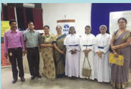
Educators and Caregivers at Sukinda and Joda - training on mental health issues - TATA Steel CSR