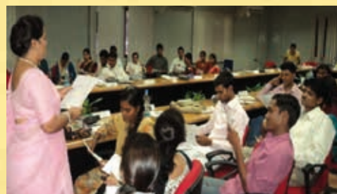
Rajiv Gandhi Foundation - capacity building of agawadi workers and block development officers at Dehradun