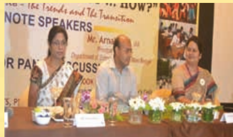
Advocating more mental health preventive programs with WB Education Department