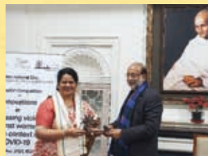
Non violence communication to fight violence against women at Gandhi Smriti New Delhi