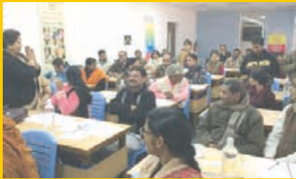
Sarv Shiksha Prasar - teachers and headmasters of government schools of Jharkhand Trained TATA MOTORS CSR

Spread across New Delhi, West Bengal, Odisha, UP, Jharkhand, Bihar, MP, Chattisgarh & Maharashtra