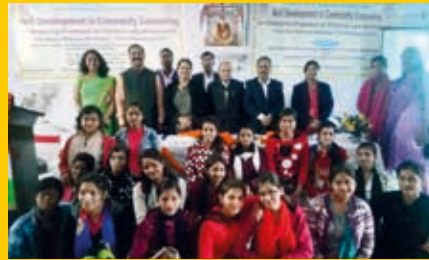
Skill development in Community counselling & Health, Kushinagar UP