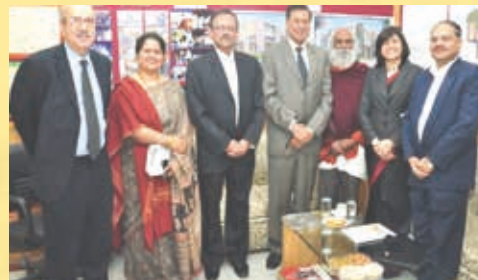
Bridging The GAP - Higher education and school UF initiative in association with Kalyan Bharti Trust, Kolkata