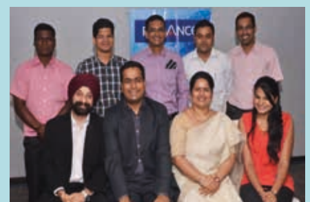
Educating Parents on good mental health practices, series of sessions at Bangalore, and Mumbai supported by CSR of Reliance India.