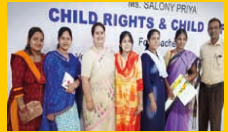
TATA Mines - Sukinda, Noamundi - CSR, enabled educators (200 plus) on child safety and abuse prevention.

The like minded people who encouraged me, walked with me, made Umeed Foundation possible.