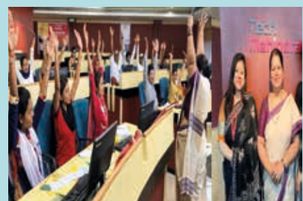
Tech Mahindra CSR in education - Teachers of seven schools and two NGOs were trained in March 2019 at Bhubaneswar on mental health needs of children & adolescents.