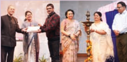
Head of Training Innovations at Centre for Cultural Research and Training CCRT under Ministry of Culture Government of India 2021-22. In this role she created innovative training modules integrating Indian cultural practices and value education for government school teachers.