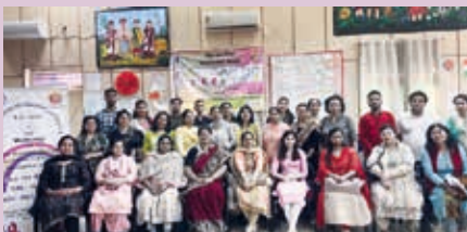
As resource person for Nipun Bharat Mission - Primary school heads trained on child mental health organized by District Inspector of schools, R.K. Puram