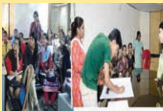
Anant Foundation - Life skill, personality development session for meritorious underprivileged college students - along with behavioral counselling, career and vocational guidance. CSR INFINITY

To conserve and create a meaningful life