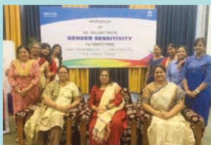
GENDER SENSITIVITY - Women empowerment TATA STEEL Sukinda