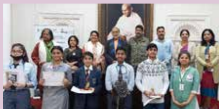
Non violence communication - for youth of 21 schools at Gandhi Smriti , New Delhi

Empowering & Energizing, Coaching and counselling for last 25 years, made me realize the POWER OF OPTIMISM, POWER OF FAITH and POWER OF RESILIENCE that makes impossible possible. The grit to face odds and deal with adversity, unearths the deepest potential in us and is so liberating and fulfilling.