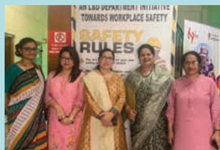
Capacity building of 200 educators of 3 educational set ups on well being, stress handling - Oil India CSR at Duliajan Assam